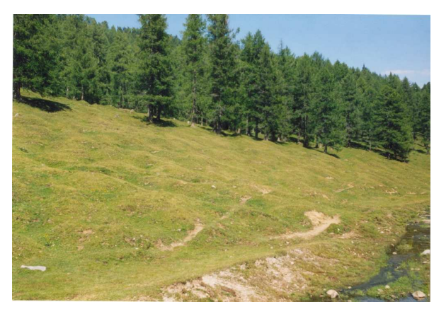
Hillock meadows at Eggeralm

The valley-like depression of Egger and Dellachalm marks a distint fault zone which separates the Lower Paleozoic banded limestone sequence in the north from less metamorphosed rocks to the south. The fault runs in southeastern direction from the farm Burgstall via Weichslereben, Schlutzenig to Kreuzgraben. Near the Poludnigalm the intensely folded banded limestones are overlain by shales and limestones of Devonian age (416 to 359 m.y. BP). They are teconically superimposed by black shales with intercalations of darkgrey limestones from the Silurian (444 to 416 m.y. BP). The summit is composed of an upside-down, deformed limestone syncline comprising different Devonian limestones. The deformation was the result of the Variscan Orogeny acting in the Carnic Alps some 340 million years ago.