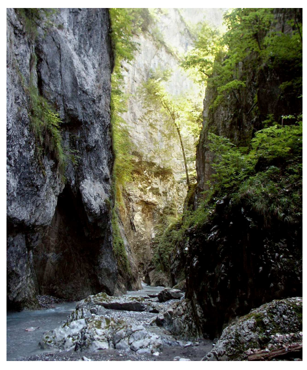
Beginning of the gorge south of the village of Vorderberg.

The rocks exposed in the gorge are banded limestones, i.e. weakly metamorphosed and deformed limestones originating from the Devonian Period (420 to 360 million years BP). They were involved in lateral displacements which occurred along the Periadriatic Fault Zone during the Oligocene. According to tectonic analysis (and models) crustal wedges north of this fault were displaced over several kilomters to the east. This movement caused the striations on the surface of the banded limestones.