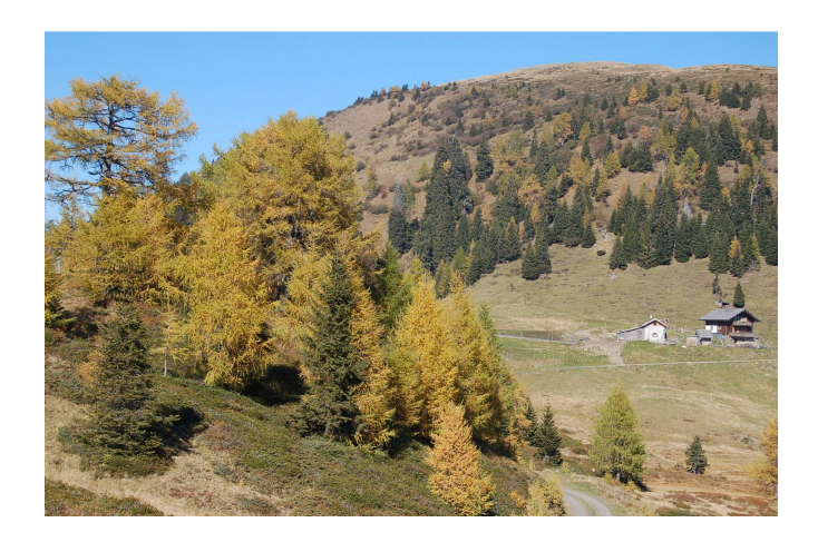
View of Rösser Hut from Collendiaul.

The Rösser Hut represents the center of the mountain farming and grazing between Lake Zollner (1,766 m), Upper Bischofalm (1573 m) and mountain Zollner (1,931 m). The diversified landscape is shown in a panoramic panel in front of the hut. From the hut in the east the Naßfeld region and and mountain Findenig can be viewed. To the south the plain of Collendiaul extends which is limited against southwest by the towering Hohe Trieb massif. Further in the west across the Kronhof Creek the meadow-covered shale mountains of Köderhöhe can be seen.