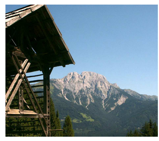
View from Oberbuchach to Reißkofel with typical hay barn.

Mountain Reißkofel represents a true landmark of the upper Gail Valley. The mighty limestone and dolomite mountain dominates not only the scenery but has also affected the immediate surrounding by the huge alluvial fan between the villages of Reisach and Grafendorf. Mass movements, faulting and the Rinsen creek are