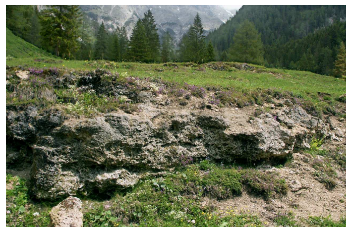
Precipitated calc-sinter on the meadow behind the spa.

The name "Tuff Spring" is derived from the highly porous calc-sinter and travertine. It is formed during escape of carbon dioxide into the atmosphere causing precipitation of slightly temperature-elevated mineralized water.