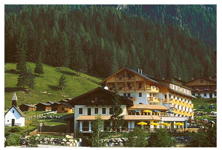
Tuff spa in the Radegund Creek.

The Radegund Valley is incised into crystalline rocks. They represent the basement of a thick sedimentary sequence starting with the red clastic Gröden Formation of Middle Permian age. This formation is followed by rocks of Upper Permian