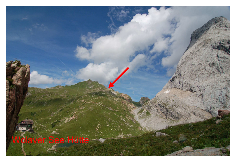
Fossil locality at second Rauchkofel-Boden (arrow).

The Geotope represents mass occurrences of which orthceratids the fullbelona to marine orthocone cephalopods with a slender elongate shell up to 9 m long (in the Ordovician!). The shell is divided into body