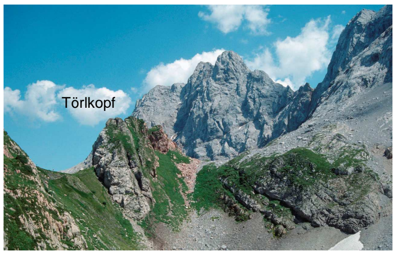
View from Wolayer Valley towards southeast to the northern and southern Valentintörl and Kolinkofel in the back.

The Valentintörl (Valentin Saddle) at an altitude of 2,138 m offers a magpanoramic nificent view. The saddle is cut between the cliff Hohe Warte to the south and the southern slopes mountain of Rauchkofel to the north. In fact, the saddle marks a distinct