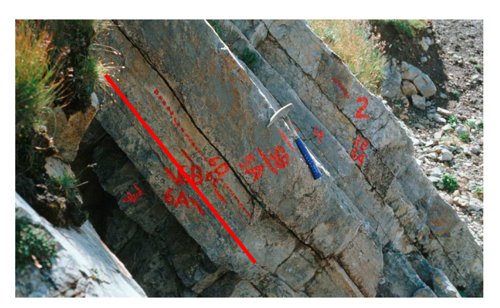
The boundary beds between the Devonian and the Carboniferous Periods.

The name "Green Crest" is derived from the grass-covered slope on the Italian side which consists of shales and sandstones of the Car-