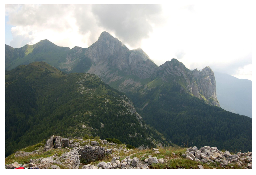
View from Kleiner Pal to Großer Pal, Pizzo di Timau at the back

The southern foresummit of Großer Pal (Pal Grande) has an altitude of 1760 m. The whole area in the surrounding of the border rock n-155 has been described in great detail during the last years and several short sections were measured and macroand microfossils were collected and processed. In the meantime, in particular, the distribution of conodonts, trilobites and ammonoids has been well documented. They occur in well-bedded greyish and fine-grained limestones of Upper Devonian age (370 to 390 m.y. BP), which display a net-like structure on the surface caused by clay interpartings. Though very abundant, the fauna is rather small when compared with