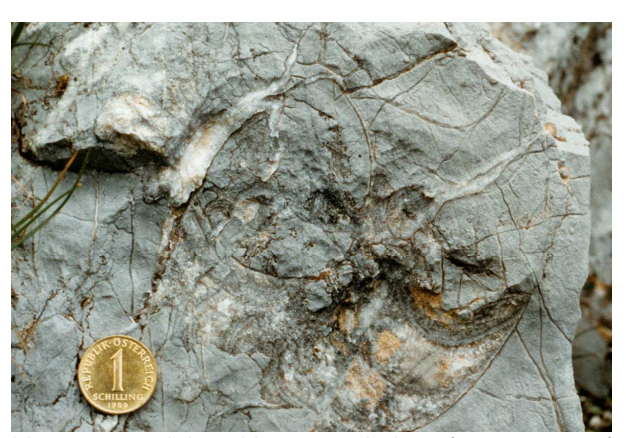
Limestone slab with a goniatite, forerunner of Mesozoic ammonites.

The southern foresummit of Großer Pal (Pal Grande) has an altitude of 1760 m. The whole area in the surrounding of the border rock n-155 has been described in great detail during the last years and several short sections were measured and macroand microfossils were collected and processed. In the meantime, in particular, the distribution of conodonts, trilobites and ammonoids has been well documented. They occur in well-bedded greyish and fine-grained limestones of Upper Devonian age (370 to 390 m.y. BP), which display a net-like structure on the surface caused by clay interpartings. Though very abundant, the fauna is rather small when compared with