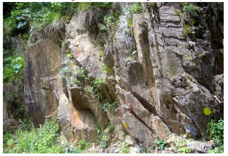
Rock association of the road section Valbertad bassa.

At the roadside siltstones with intercalations of limestone nodules of Ordovician age (Katian Stage) are exposed which yielded some of