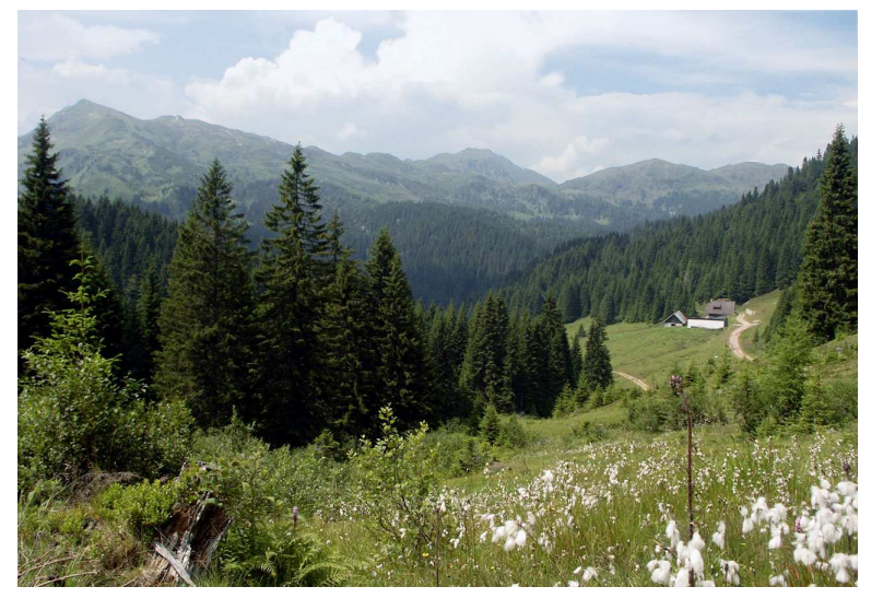
Casera Valbertad bassa

been recovered. The phosphatic teeth-like remains belong to a fishlike and 3 to 5 cm long animal, the function of which is still being debated although a filter or grasping apparatus is most likely. Recently, conodonts have been assigned to an extinct group of chordates; they disappeared some 160 million years ago.