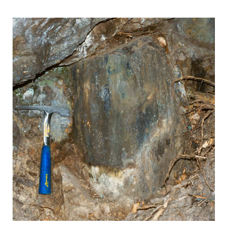
Two out of a dozen of petrified trees of Laas.