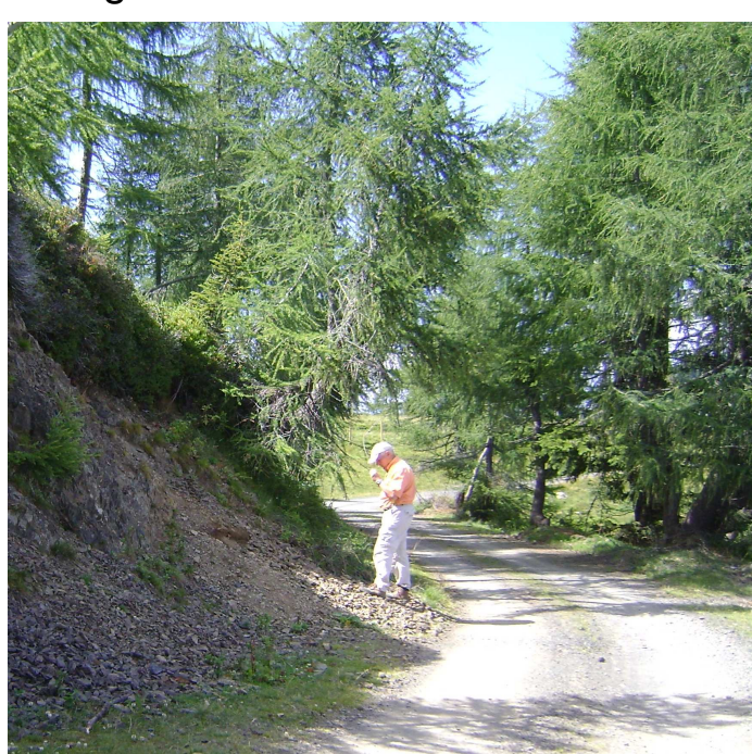
The fossil locality at the road from Rösser Hut to Zollner Hut.

Most probably, this fossil association belonged to a shallow coastal environment with low energy although full-marine conditions prevailed. Since the sea expanded at the beginning of the Upper Carboniferous rather rapidly, such a milieu may not have lasted for a long time.