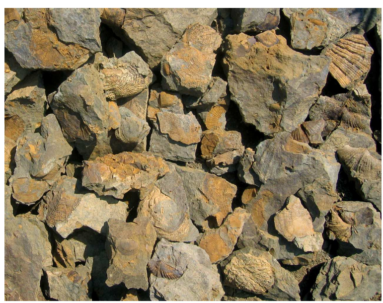
In loose blocks fossils are particularly abundant. Almost every slab contains complete shells or some fragments.

The peculiar some 300 m.y. old fauna is named "Waidegg Fauna" and belongs to the late Carboniferous Auernig Formation. It is dom-