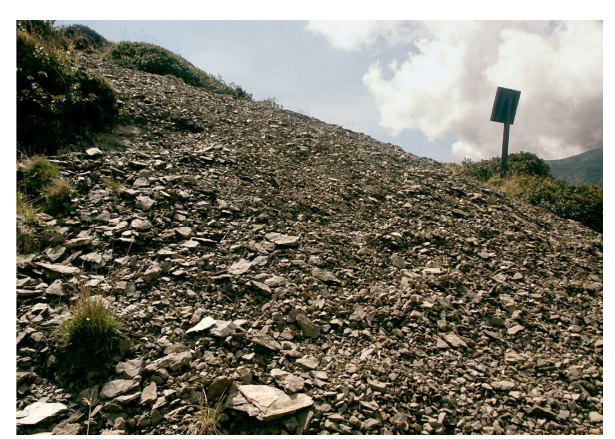
Fossil locality east of Waidegger Alm.

The so-called trilobite cemetery is located east of the Alm and close to the saddle. It was discovered in the early 30ies of the 20<sup>th</sup> century. The abundand and highly divsere fauna occurs in earthy, softy and brownish shales and mostly comprise limonitic imprints. The majority of the fossil remains are excellently preserved. According to its composi-