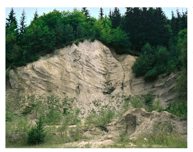
The abondoned sand pit of Paßriach.

The sandpit south of Presseggen Lake belongs to a bigger damming body which was deposited at the margin of the melting Gail glacier during the end of the Würm glaciation (approx. 120,000 10.000 to years BP). According to the delta-like strongly inclined sand and gravel layers a small adjacent lake