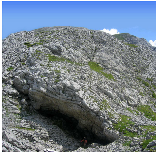
Entrance to the cave in 2.130 m altitude close to border rock p-26.

Viewed from Naßfeld the mountain Roßkofel resembles a huge loaf of bread. However, it has an interesting geology. First of all, it is his "cap" of Upper Carboniferous strata (formed approx. 330 m.y. BP) which unconformable overly very fossiliferous Devonian limestones. Solitary and colonial corals, brachiopods, crinoids, calcareous alge and stromatoporoids occur