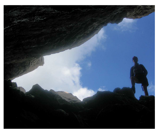
View to the mouth of the cave.

The flow conditions in the cave vary depending on time of the year and weather conditions. The most impressive underground river system is named "Yukon", a karstic river in the lower part of the cave (for more details see Geotope no. 70).