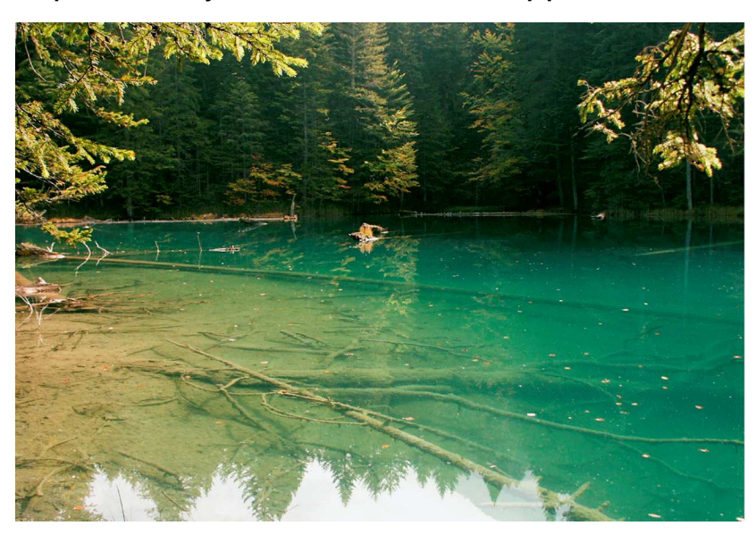
Bodensee exhibiting clearly clayish sediments covering the lake bottom.

The small basin of the lakes are the result of the last Ice Age (some 70,000 to 10,000 years BP) when this area was subject to glacial erosion leaving a ground moraine on the lakes bottom. The sediments of the latter formed an impermeable horizon for the water. Both lakes are spring-fed between the boulder beds and the landslide of the mountain Gartnerkofel. While the western Bodensee exhibits an area of some 6,000 m², the lake to the east is much smaller. Originally, both lakes were apparently connected and later separated by debris from the Reppwand Cliff.