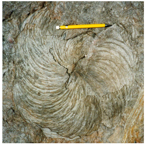
The Trace fossil Zoophycos testifies biological activity of the soil by an infauna.

On the northern slope of the mountain Garnitzenhöhe (1951 m) a trail passes platy sandstones and pebble-bearing coarse-grained sandstones showing some inclined and graded layers within one bed. Gradation means that the size of the grains is decreasing from the base to the top. This peculiar type of rock is the fossil counterpart of conditions prevailing in recent river deltas where sediment-loaden water is discharged in such a manner that bigger clasts are less far transported than smaller ones.