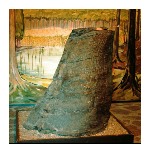
Petrified rest of a Sigillaria trunk

are some chances to find good material in the debris. It is evidently that this flora was growing close to here and was not far transported. Apparently they grew in a bog with an intervening tree vegetation close to the coast of the Tethys Sea.