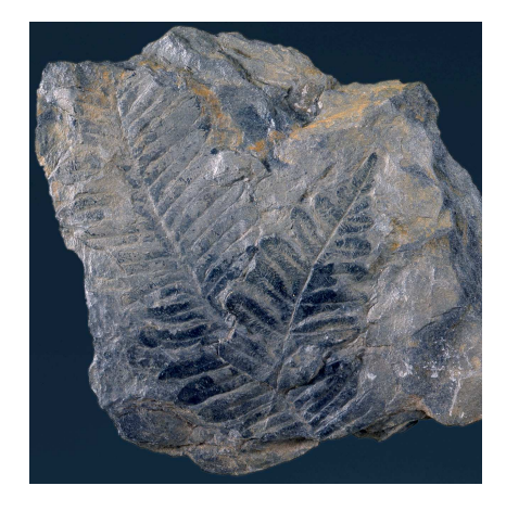
Inprints of ferns

The rich plant locality from the Upper Carboniferous (ca. 300 m.y. BP) is exposed on an altitude of 1730 m at the northwestern slope of the plateu-like Krone mountain. The plants occur in greyish fine-grained sandstones and siltones. Besides members of the clubmoss family (Lycopodia) represetatives of horsetail (Equisetophyta), Cordaites (relatives of needle trees) and imprints of different kinds of ferns (Filicopsida) and seed ferns (Pteridospermae) abundantly occur. There