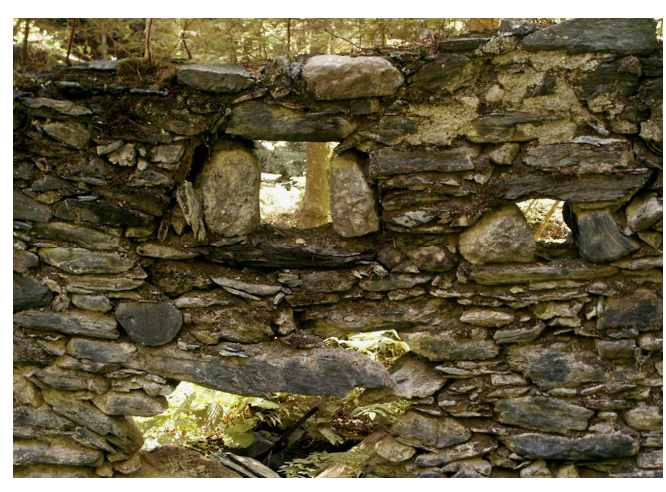
Lapsed mill below the Waterfall

different water volumes which either fulfil the requirement for a real waterfall or it is reduced to a gully with low amounts of residual water. Many years ago the Aßnitz Creek was driving mills. Today stony walls are remnants of this time