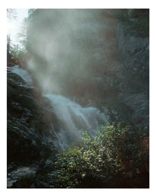
The Nölbling Waterfall during snow melting in spring-time.

The waterfall can be reached within a few minutes from the bridge at the beginning of the Nölbling Creek. The water rushes over several rock steps composed of dolomitic rocks with shales and sandstones of the Hochwipfel Formation above. The waterfall is a distinct example for churning and thunderous water which generates a kind of white foam and spray of fine water droplets in the surrounding.