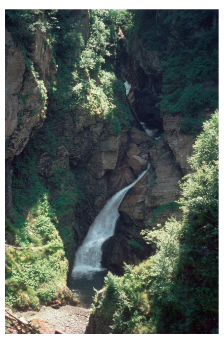
The Cascade Fall near the pioneer rest incised into colourful limestones of Devonian age.