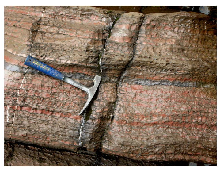
Clayish partings form a netlike structure on the surface of reddish limestones.

The Cascade Fall can be reached along the trail through the Nölbling Creek to Lake Zollner at an altitude of 1300 m. The rushing water strongly contrasts with the greyish and reddish limestones of Devonian age (420 to 360 m.y. BP). The different colours originated from varying contents of iron and manganese-bearing minerals and their weathering. In addition, clayish partings form a netlike structure on the surface which in addition to its colour reflects a very beautiful rock.