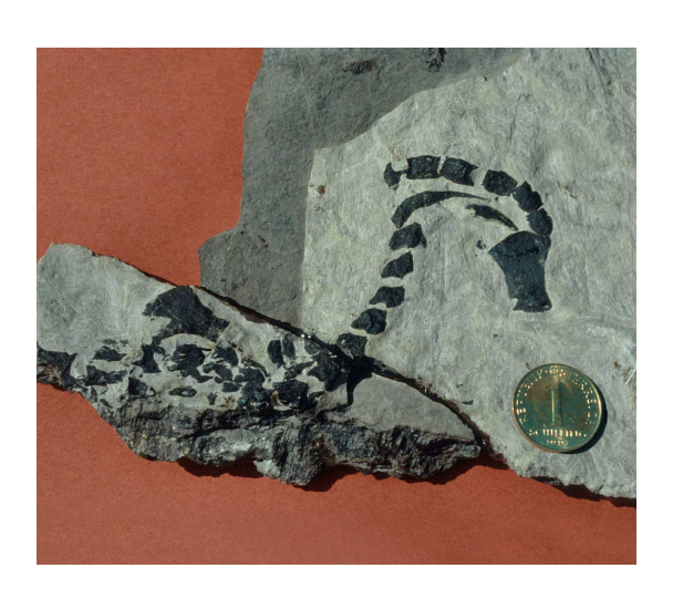
Vertebra rests from a Sauropterygier-Reptil from the Triassic.

On the slab parts of the backbone, a rib and loose pelvic bones could be identified. The findingy suggest a shallow sedimentary basin adjacent to an emerged land.