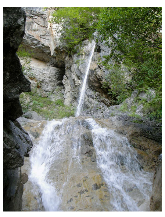
Natural monument Mühlschuß Waterfall in Triassic Limestones.

found which belonged to the Sauropterygier living in the sea.